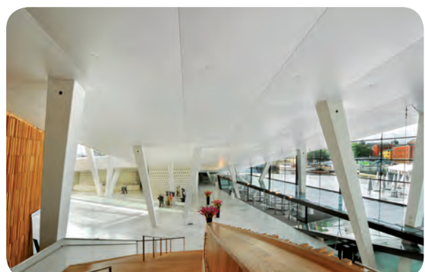
Opéra d'Oslo - arch. : Snohetta Architects 2009 European Contemporary Architecture Award