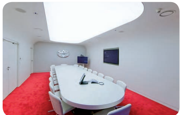
arch. : Ora Ito