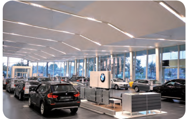
arch. : FRAP