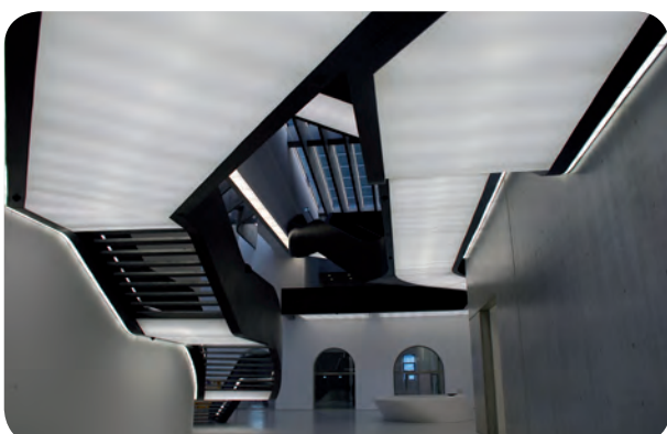
MaXXI Museum, Roma - arch. : Zaha Hadid 2010 RIBA Stirling Award